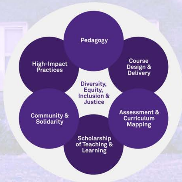
OUR SEVEN INTERCONNECTED FOCUS AREAS

Multi-vocal Evidence Diverse Collaborations